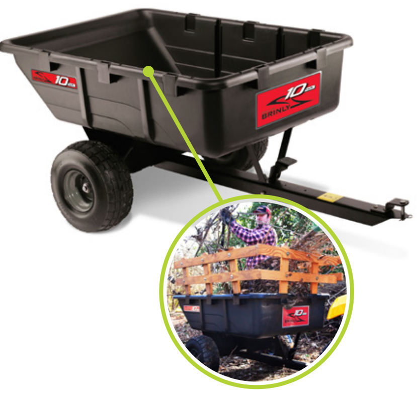
STAKE SIDE KIT FITTED