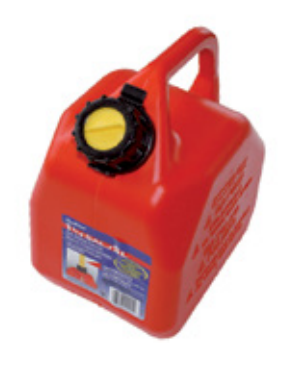
PART NO. 95-8453