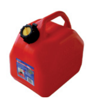
PART NO. 95-8460