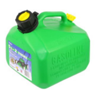
PART NO. 95-8454