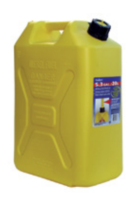
PART NO. 95-8461