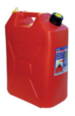
PART NO. 95-8463