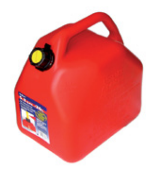
PART NO. 95-8462